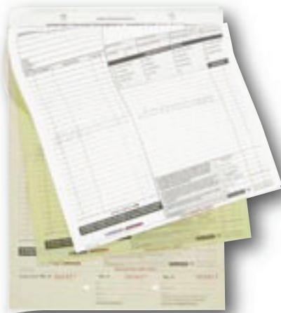
Multiple Copy Forms