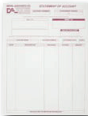
Cut Sheet Invoice Forms

Effective everyday office forms are integral to your business success.