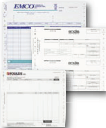
Continuous Invoice Forms